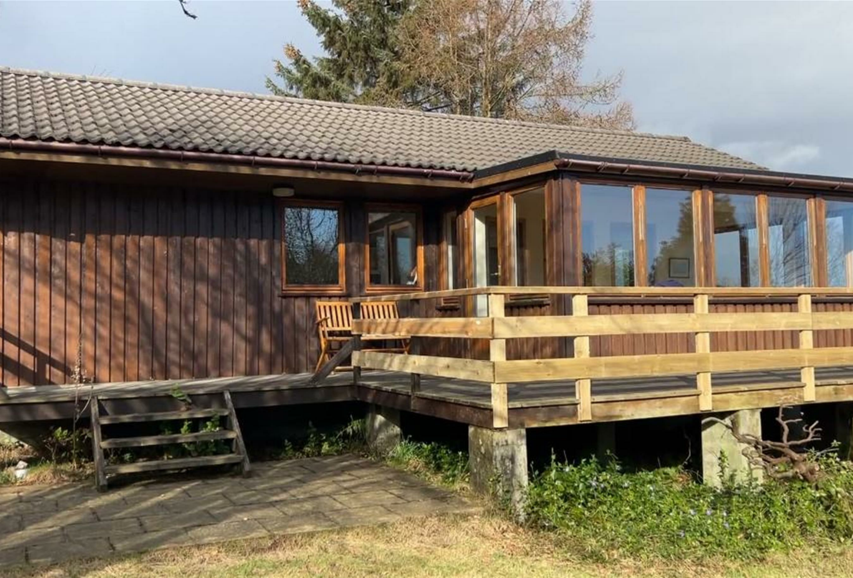
Cedar Lodge, Whiting Bay, Isle Of Arran, KA27 8QR